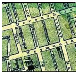
THE BARRETT'S OF WIMPOLE STREET