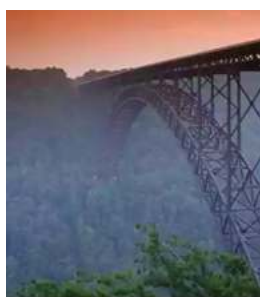
Scenic Routes & Byways WEST VIRGINIA SU CLAUSON-WICKER

West Virginia's scenic routes and byways offer a journey through some of the most stunning landscapes in the country. From the majestic New River Gorge to the enchanting Potomac Highlands, and from the Allegheny Mountains to the captivating Blackwater Falls, the state is a paradise for those seeking natural beauty. Whether you're a seasoned road tripper or a first-time visitor, these scenic routes will leave you in awe of West Virginia's breathtaking landscapes. So grab your camera, hit the road, and get ready to experience the sheer magnificence of West Virginia's scenic byways.